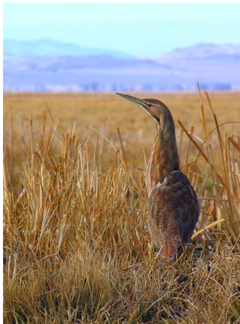
“American Bittern” Carson Lake – Winter 2007

Lovelock Cave - Humboldt Sink - Long before it became known as Lovelock, this area at the end of the Humboldt River was known as Big Meadows, a place where emigrants on the Overland Trail rested and fed their livestock before pushing on to the dreaded 40-Mile Desert. This field trip will explore the Lovelock area including the Leonard Rock Shelter to view Indian petroglyphs, fascinating tufa hangings, and the Lovelock Cave, a prehistoric Indian shelter from which thousands of artifacts have been excavated, including the oldest known duck decoys (dated at almost 2,000 years old). We will also visit the nearby Humboldt Wildlife Area, home to thousands of migrating and nesting waterfowl, shorebirds, and other animal and plant species. Box lunches and transportation are provided; meet at the Registration Area, on Sunday at 7:00 a.m. $40.00