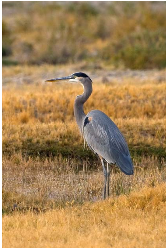
“Great Blue Heron” Carson Lake – Fall 2008

Tours are taken at your own risk. All possible safety precautions will be taken by festival organizers and tour leaders, and in some instances, a waiver might be requested prior to admittance on the tour. Tours with asterisks are active tours and attendees should ensure they are in good physical condition (could include walking or other forms of exercise). Tours may also be canceled or changed without notice.