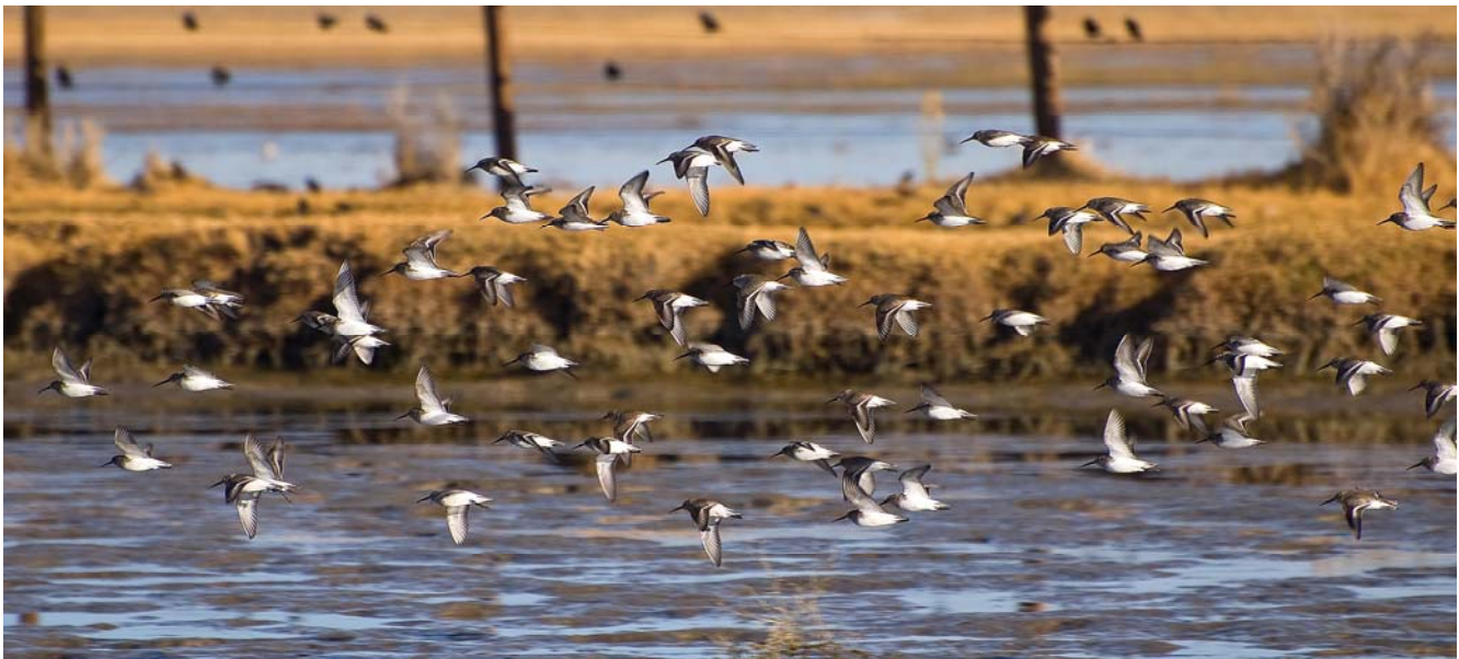
"Flock of Dunlin" Carson Lake – Fallon 2008

Partake and enjoy - Celebrate the Migration!!!!!!! The Spring Wings Planning Committee